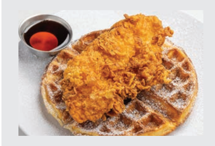
Hilltop Coffee + Kitchen 718 S Hill St. findyourhilltop.com/dtla