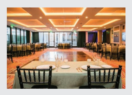
The Top of the Hub 700 Wilshire Blvd, Suite 700 itsgabevents.com/top-of-the-hub