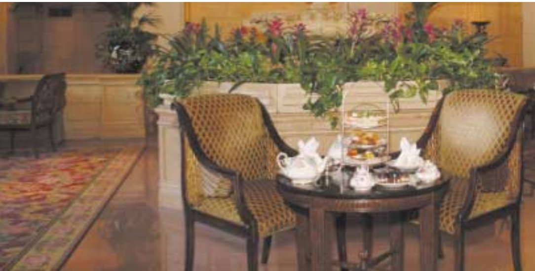
Now serving high tea at the Millennium Biltmore.

To make reservations, call 213.624.1011 extension 1562.