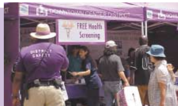
Free health screenings were offered at the DCBID's Community Outreach Fair.

The Community Outreach Fair provides an excellent example of the how the business community, represented by the DCBID, makes a direct impact on people in need within our Downtown community.