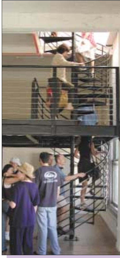
Housing tour attendees exploring a Downtown loft.